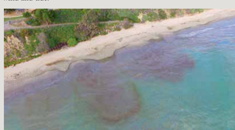
March 3, 2016 Lookout Park, Summerland

Today, these improperly abandoned wells are leaking—fouling not only Summerland Beach, but neighboring beaches as well, depending on wind and tide.