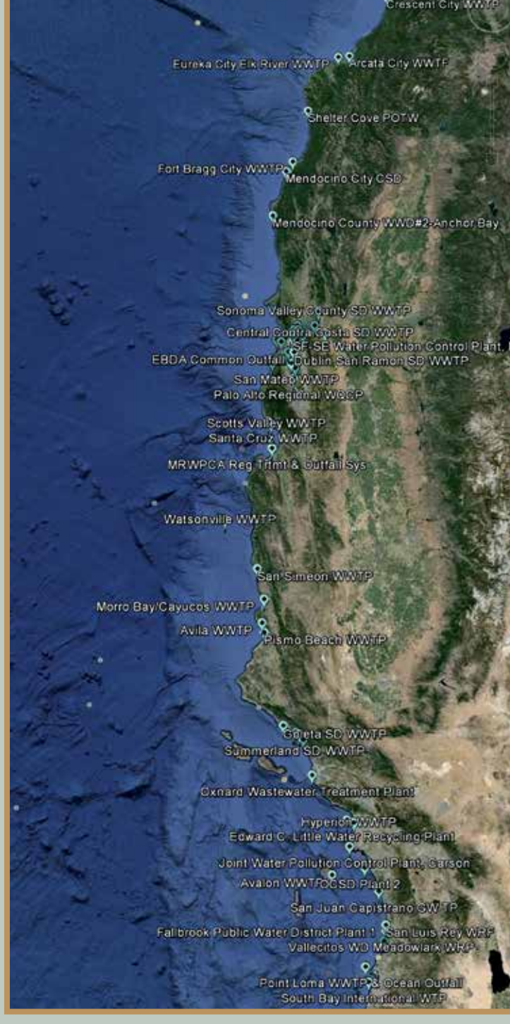
Preliminary sites of municipal wastewater dischargers to the Pacific Ocean & coastal bays that are included in the state inventory. Note: not all dischargers are represented on this map.

This project has the potential to fill in critical missing data points in California water management and ensure the protection of our limited water resources. It is our hope that the project will better inform the water debate at a time when we need to prioritize sustainable water resources, like recycled water.