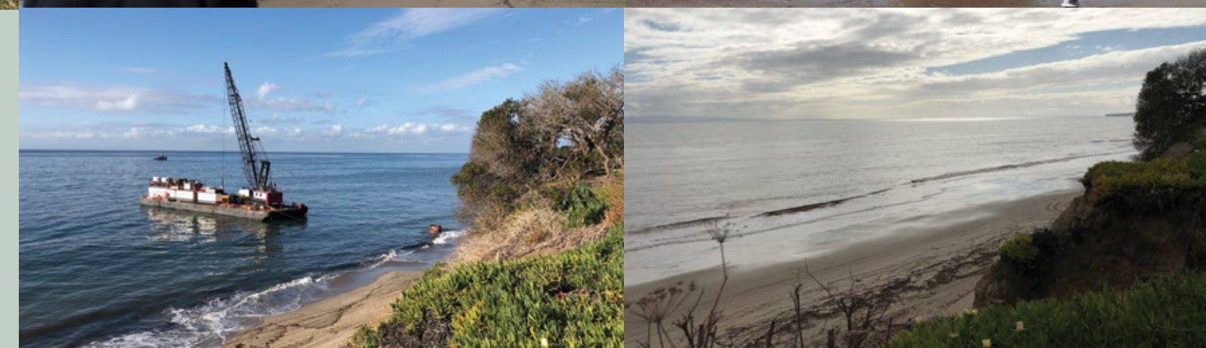
The giant barge from Curtin Maritime, Long Beach, is towed into Summerland Beach in front of Becker Well, and drops a giant pipe onto the beach. This "cofferdam" is hammered into the sand around the well and pumped clear of sand and water to create a work space. The work platform is lowered on top of the cofferdam so that workers can descend to the top of the well and do their magic.