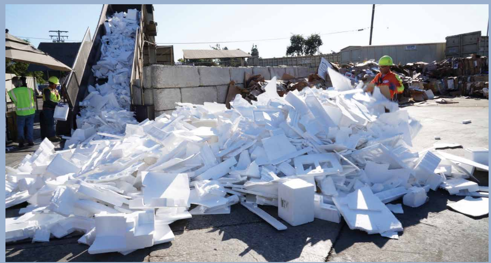
Styrofoam baling operations at MarBorg Industries, David Love Place, Goleta

HTO/MarBorg Industries Have Established a One-of-a-Kind Program Keeping Mountains of Styrofoam out of Landfills (& the Ocean)